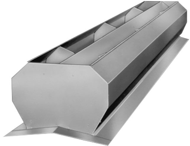
MODEL RV INDIVIDUAL RIDGE VENTILATOR

All publications listed above can be obtained from Romla Ventilator Company